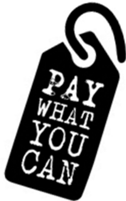
Benefits of CSDA Membership

Join the growing network of special districts through the Pay-What-You-Can membership offer. Simply choose the amount you can afford to pay to become a member of CSDA, and your entire district will receive access to CSDA's member benefits and value-added programs through December 2022!