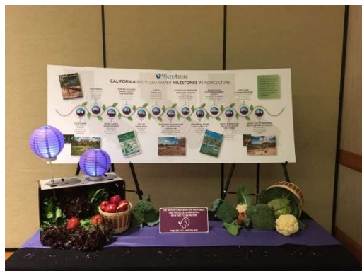
Poster from 2019 water reuse conference